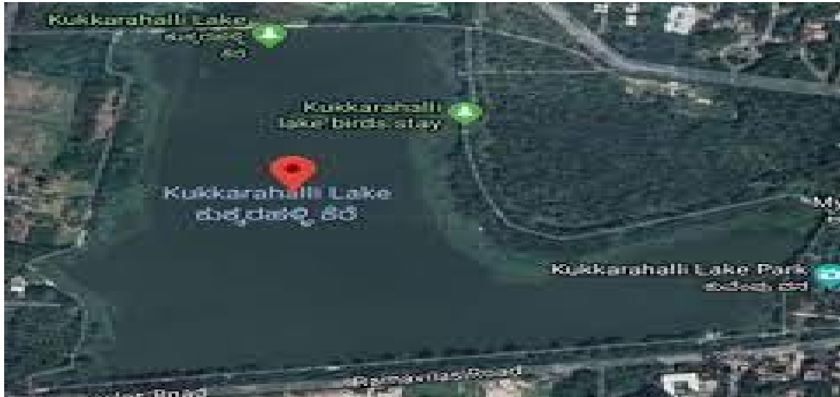
Fig. 2. Map of Kukkarahalli Lake