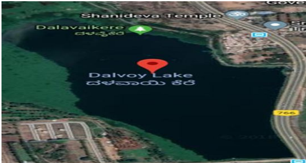
Fig. 7. Map of Dalvoy Lake