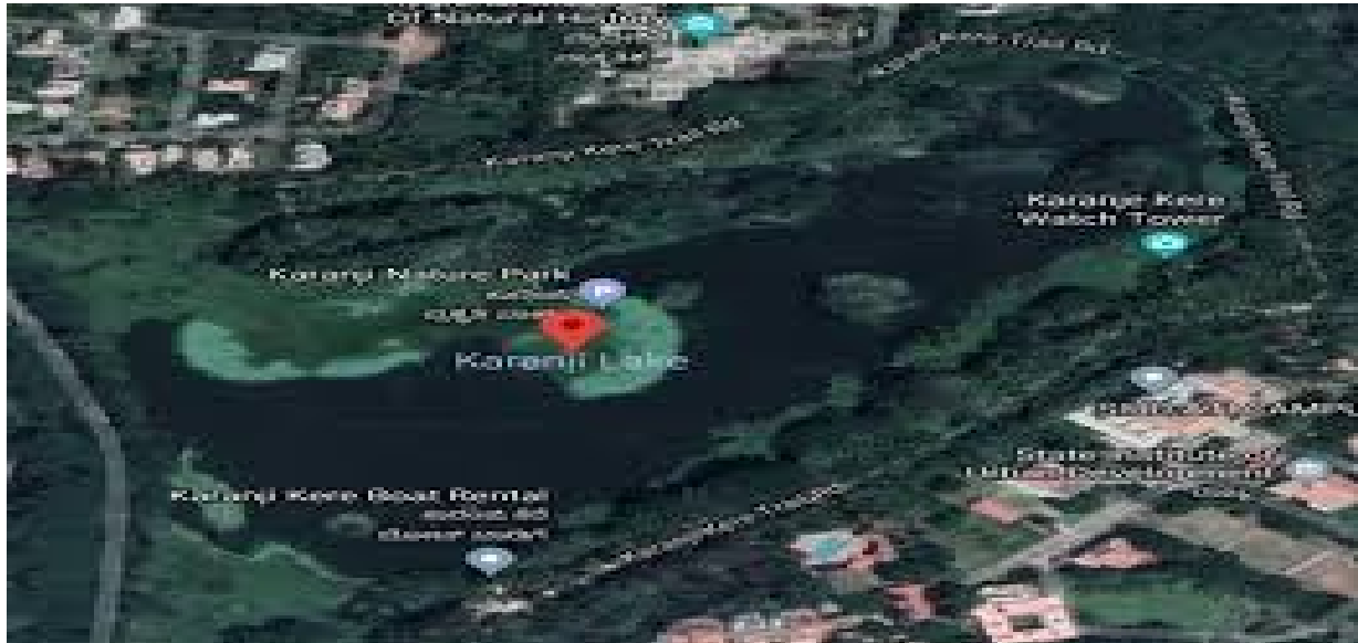
Fig. 3. Map of Karanji Lake