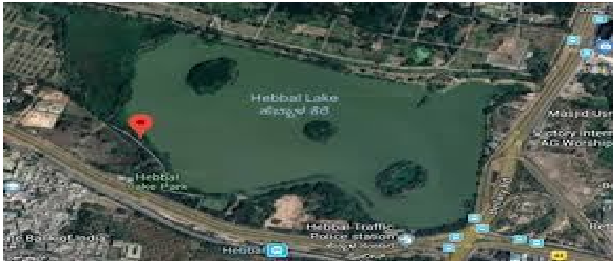
Fig. 5. Map of Hebbal Lake