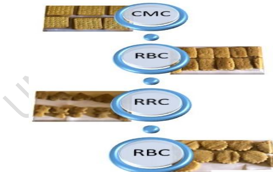
Figure 1. Pictures of cookies

The recipe for the cookies included 250 g flour, 63 g fat, 63 g sugar, 1 g of salt, 25 mL whole egg, 5 g powdered milk, 1.5 g nutmeg, 1 g baking powder, and 20-60 mL water. The flour, sugar and fat were mixed using a table-top mixer (Triumph, KE 1150) until the mixture was fluffy. Other ingredients, eggs, milk, baking powder, ground nutmeg, and salt were added to obtain a dough, which was kneaded, rolled out, cut into shapes and baked in an air-dry oven at 180 °C for 20 min to a golden-brown colour. The cookies obtained (Fig. 1) were packaged in a non-sticky film.