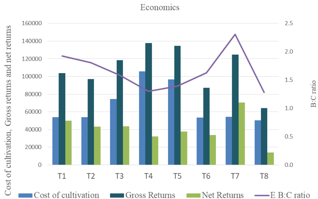
Fig.2. Economics of pearl millet in response to weed management practices

The treatments are T 1 - PE of Atrazine 0.5kg/ ha +1 Hand Weeding at 30 DAT, T 2 - Two Hand Weeding at 15 and 30 DAT, T 3 - Paddy straw mulching at 5t/ ha 3 DAT, T 4 - Black polythene mulching at 3 DAT, T 5 - Black silver polythene mulching at 3 DAT, T 6 - Intercropping of pulses (cowpea) (1:1), T 7 - Intercropping of pulses (cowpea) (1:1) + PE Pendimethalin 0.75 kg/ ha, T 8 - Un- weeded check.