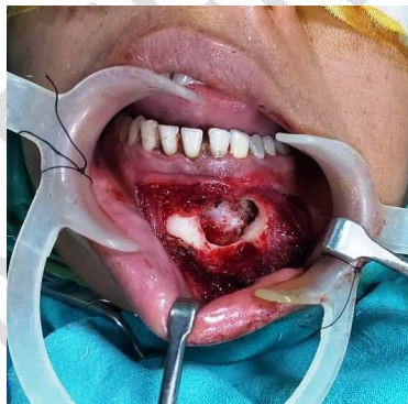
Figure 2: Wide surgical enucleation of soft, doughy mass was done through intra-oral papilla preserving flap followed by suitable dissection preserving the vital nerves and vessels in the vicinity