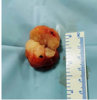
Figure 3: The specimen sent for histopathological examination