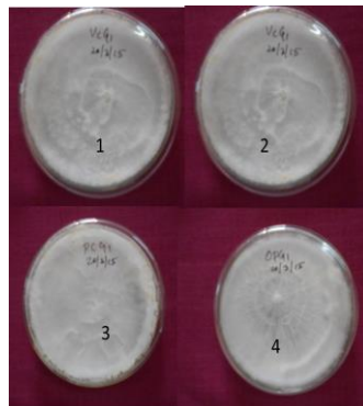
Fig.(2a & 2b) Ganoderma Isolates

The fungi Ganoderma lucidum and G.applanatum causing coconut basal stem rot disease were isolated from the roots of the diseased coconut in India. G.lucidum was predominately associated with the disease and its pathogenicity was established on 35 years old coconut palms in Tamil Nadu (Vijayan and Natarajan, 1972, Bhaskaran et al. , 1990 and Bhaskaran et al. , 1991). CABI Bio science, United Kingdom made isolation studies from the disease endemic areas of Tamil Nadu also confirmed the presence of Ganoderma spp. in root and stem tissues of diseased coconut palm. Thirty five Ganoderma isolates of coconut from Andhra Pradesh, Karnataka and Tamil Nadu showed that the genetic similarity among the isolates ranged from 0 to 88.4% with RAPD PCR based clustering (Anonymous 2014). Rajendran et al. (2008) analyzed the laccase enzyme activity for the assessment of virulence of the Ganoderma isolates and cloned the partial sequence of laccase gene from highly virulent isolate.