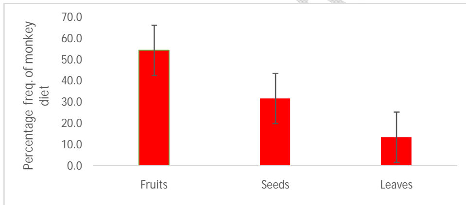
Figure 3: Food selection frequency by the Sclater’s guenon at Lagwa