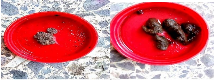
Plate 1: Sclater's guenons faecal samples (dry and wet season)