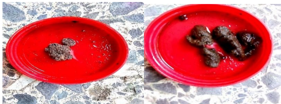
Plate 1: Scater's guenons faecal samples (dry and wet season)