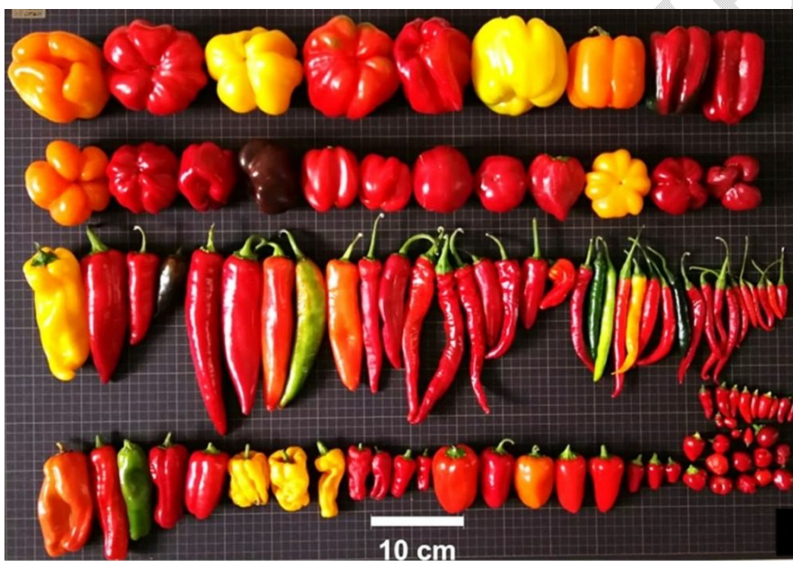
Genetic Diversity in Chilli Landraces from China 32

In another recent study conducted at Kirsehir Ahi Evran University, Turkey evaluated 69 chilli genotypes (56 local hybrids and 13 reference cultivars) for genetic variation using six SSR marker primer pairs linked to fruit morphology, and for the analysis of genes involved in capsaicinoids biosynthesis and resistance of P. capsici using SCAR (Sequence Characterized Amplified Region) markers. The results of this study showed the SSR markers such as CaMS015 and CAMS452 were found to be highly polymorphic among the genotypes, and the SCAR marker BF6-BF8 linked to pungency revealed the pungent genotypes whereas another SCAR marker, OP004.717 linked to P. capsici resistance revealed the resistance genotypes [30].