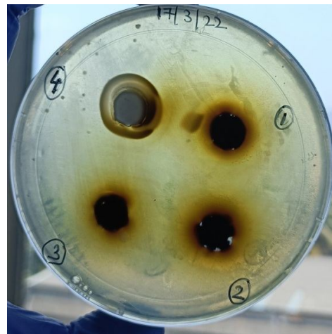
Fig. 4 – zone of inhibition