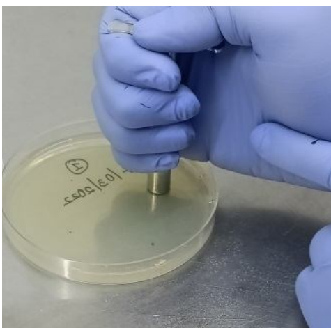
Fig. 3 Detection technique