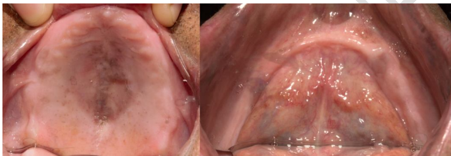
Figure 1: Intraoral view of maxillary and mandibular arch

12. Ikbal M, Mude HA, Dammar I, Launardo V, Sudarman IA. Locator or ball attachment systems for mandibular implant overdenture: a systematic review. Sys Rev Pharm 2020;11(9):15-19.