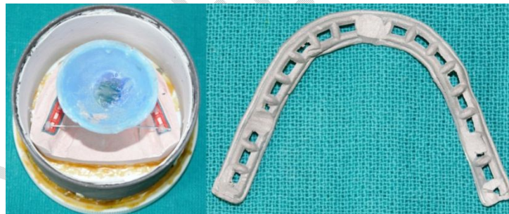
Figure 6: Refractory cast with wax pattern and sprue attachment and finished metal framework