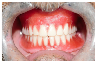
Figure 7: Denture trial