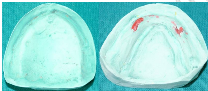
Figure 5: Master cast of Maxillary and mandibular arch