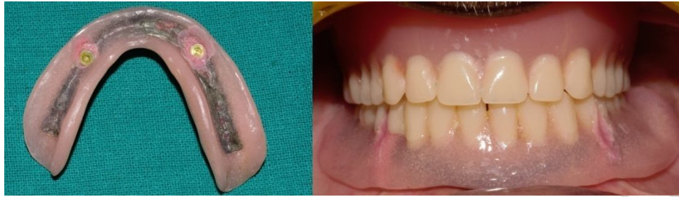
Figure 8: Intaglio surface of denture after pick up of female attachments and insertion of denture