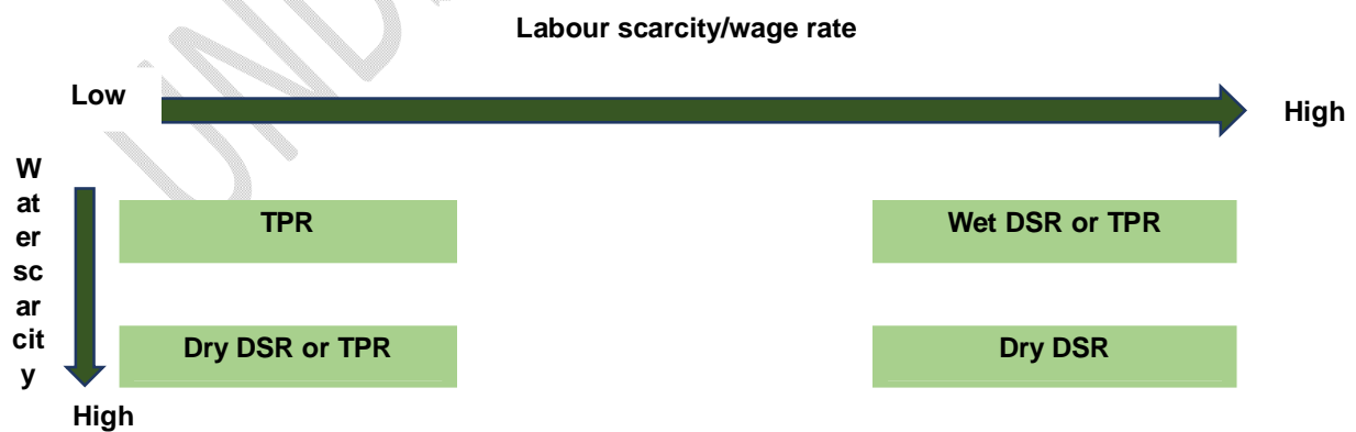
Figure 1. Global factors driving the switch from PTR to DSR