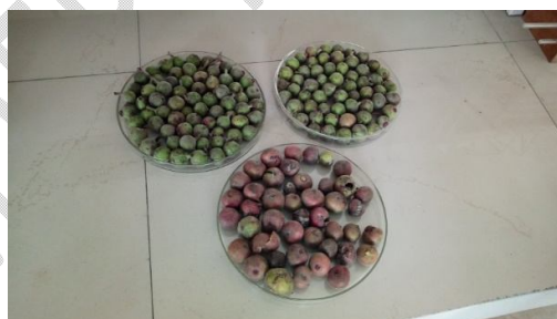
Fig. 1: Cluster fig fruit