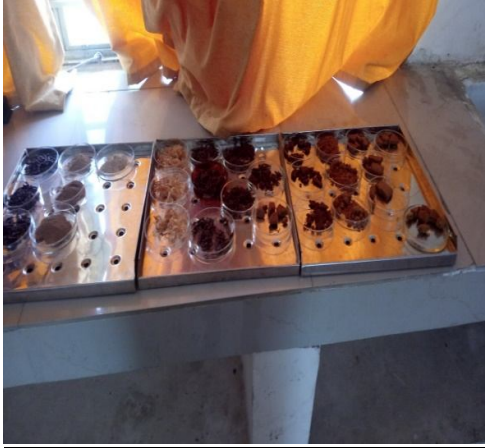
Fig.2 Weighted Samples to be kept in oven for Moisture Estimation