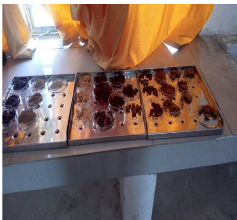
Fig.2 Weighted Samples to be kept in oven for Moisture Estimation