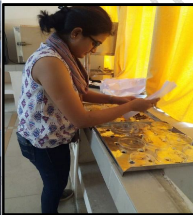
Fig.3 Samples kept in dishes