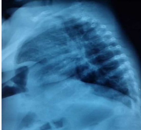
Fig.2. The lateral chest X-ray showing a colothorax in the anterior location to the heart.