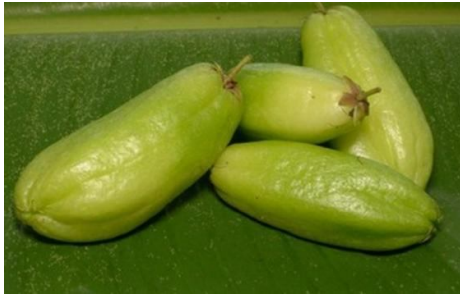
Figure 1. Star fruit

Star fruit (Figure 1) is the result of the plants that are often found in people's yards, maximum height of 10-15 m, grows naturally and is rarely commercialized. Flavonoid and saponin compounds are antimicrobial compounds that are very effective in inhibiting the growth of viruses, bacteria and fungi as well as easily soluble in polar solvents such as ethanol, butanol, and acetone. Likewise, alkaloids have the ability as an antibacterial by interfering with the constituent components of peptidoglycan in bacterial cells, while tannin are polyphenolic compounds (C6-C3-C6) that precipitate proteins and form complexes with polysaccharide, resulting in microbial cell walls lysis .