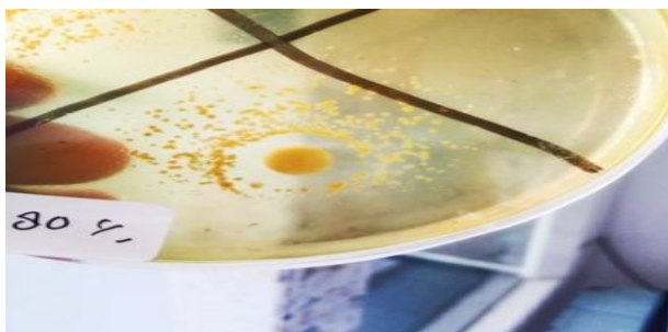
Figure 3. Inhibition zone of star fruit extract against Vibrio cholera

The total Vibrio cholera used in this study was 2.24 \times 10^7 CFU/ml. The inhibition zone on TCBS media appeared after 24 hours of storage. The formation of an inhibition zone indicates that star fruit extract has bio active compounds that act as antibacterial activity, so that they can inhibit the growth of Vibrio cholera (Figure 3).