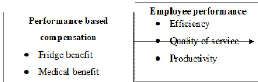
Figure 1: conceptual framework