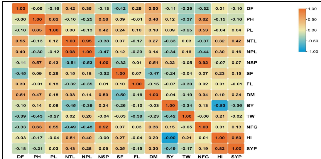
TABLE 3: Genotypic path coefficient for grain yield and its component traits in rice