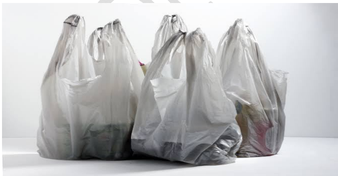
Plate 1: Bags containing sample collected

Three (3) samples of soil (0–15 cm) were taken at distances of 0, 20, and 40 meters from the two carautomobile workshop using a soil auger. Additionally, soil samples that acted as controls were gathered from a distance of 1 km from each of the car workshops. To determine the presence of heavy metals, the soil samples were placed in plastic bags, tagged, and submitted to a lablaboratory . The soil samples were air dried, then used to make a stainlesssteel sieve after being smashed using a mortar and pestle. Ten milliliters of concentrated nitric acid were added to one gram of the sieved soil in an acid-washed round-bottom flask, and the mixture was heated on a hot plate for 15 to 20 minutes. After letting it cool, it was filtered into a 50 ml standard flask and brought up to the appropriate mark with distilled water.