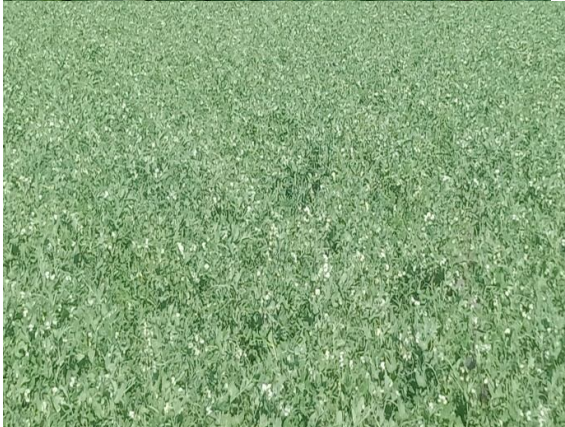
Plant height 1.85 meters on 89 DAS