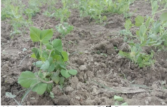
12 January, 2023 , 53 rd Day after sowing