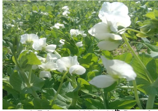
8 February 2023 , 80 th Day after sowing