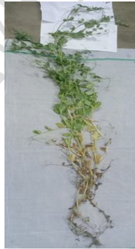
Fig 7. Full length with roots