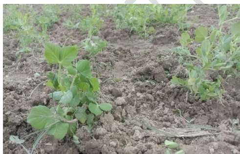
Fig 1. 12 January, 2023 , 53 rd Day after sowing