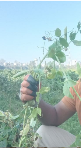
Fig 5. Harvesting time 4 March