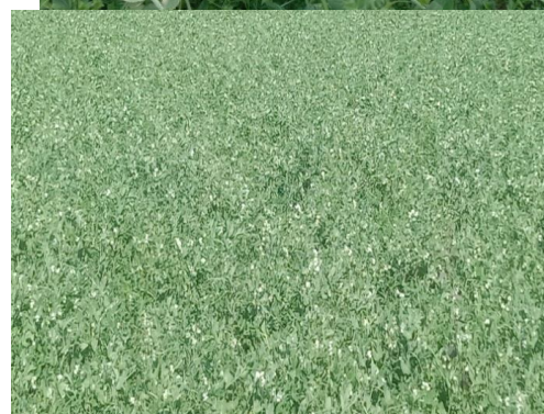
Fig 4. 100 m 2 area with abundant flowering