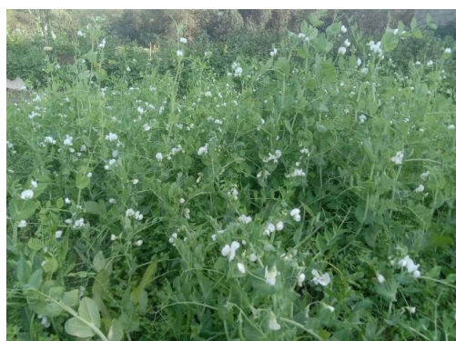
Fig 3. Plant height 1.85 meters on 89 DAS