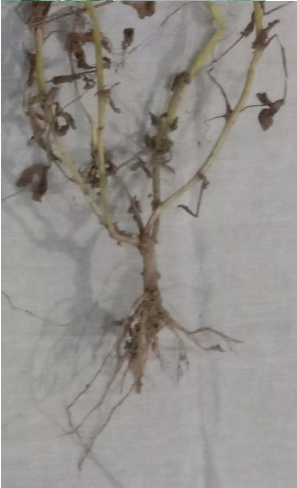
Fig 6. Pri.roots 15.4 in number