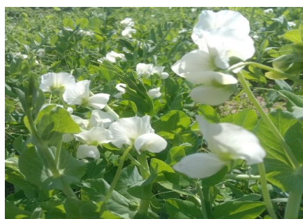
Fig 2. 8 February 2023 , 80 th Day after