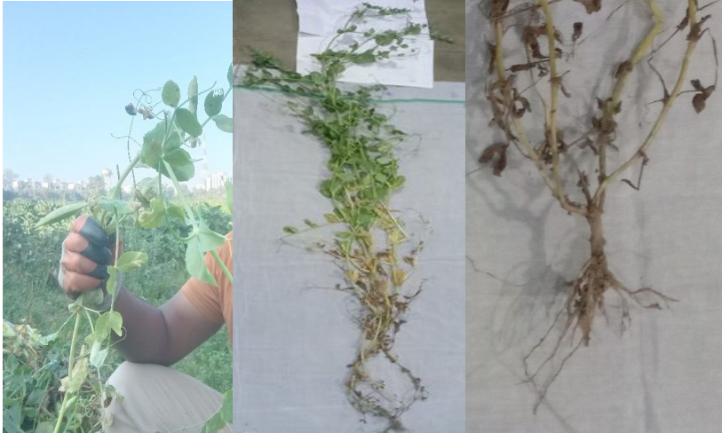
length with roots Fig 6. Pri.roots 15.4 in number