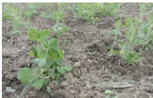
Fig 1. 12 January, 2023, 53 rd Day after sowing