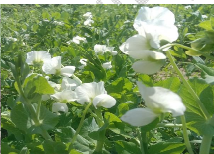
Fig 2.8 February 2023 , 80 th Day after