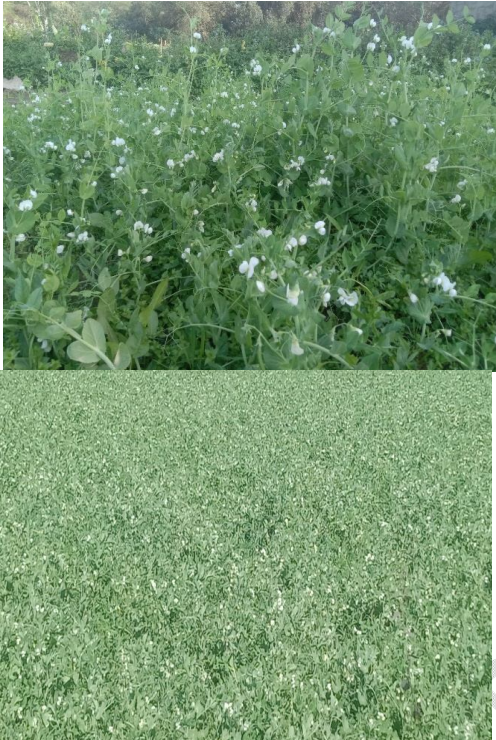
Fig 4. 100 m 2 area with abundant flowering