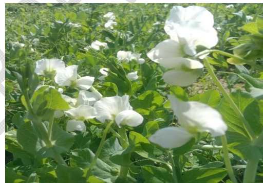
Fig 2. 8 February 2023 , 80 th Day