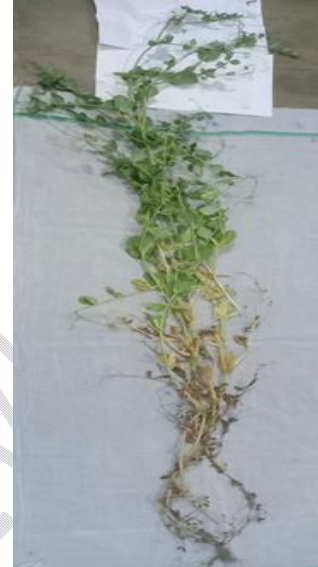
Fig 7. Full length with roots