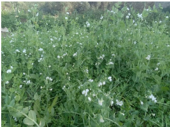
Fig 3. Plant height 1.85 meters on 89 DAS