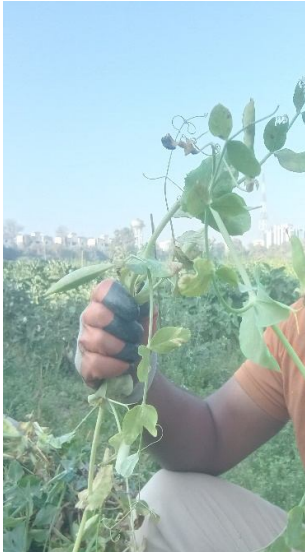
Fig 5. Harvesting time 4 March