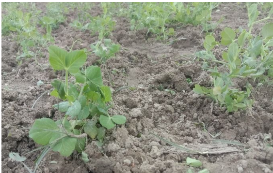
Fig 1. 12 January, 2023 , 53 rd Day after sowing after