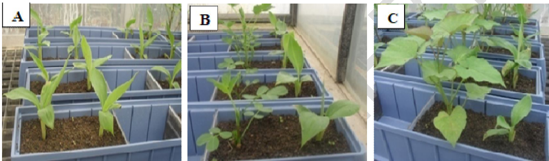
Fig. 1: Plant combination in different cropping systems: A: Banana-Banana; B: Banana-Groundnut; C: Banana-Sweet potato.

Four weeks after AMF inoculation, nematodes were introduced in the holes (2cm depth) made between the two plants in nematode treatments. 5 ml aliquot that contains 1000 nematodes (juveniles and adults) were inoculated per plant combination with a syringe. Plants were not watered for 24 h to ensure that the nematodes were not washed away. The plants were fertilized with 2g of NPK (10-11-18) per box two weeks after transplanting and were watered when needed.