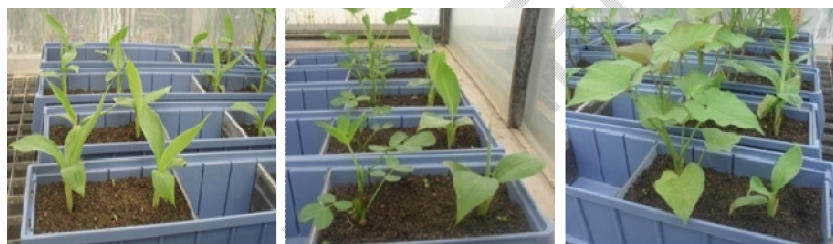
Fig. 1: Plant combination in different cropping systems: A: Banana-Banana; B: Banana-Groundnut; C: Banana-Sweet potato.

Four weeks after AMF inoculation, nematodes were introduced in the holes (2cm depth) made between the two plants in nematodes treatments. 5 ml aliquot that contains 1000 nematodes (juveniles and adults) were inoculated per plant combination with a syringe. Plants were not watered for 24 h to ensure that the nematodes are not washed away. The plants were fertilized with 2g of NPK (10-11-18) per box at two weeks after transplanting and were watered when needed.