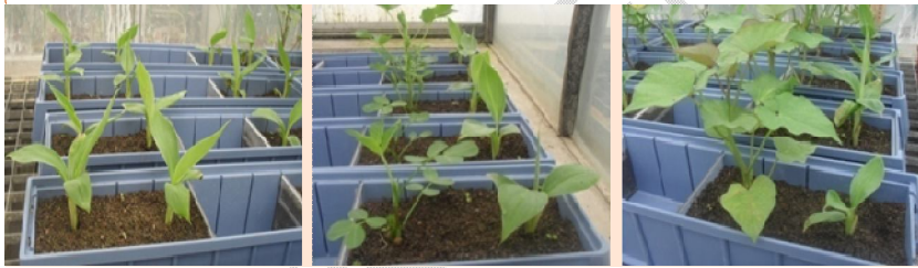
Fig. 1: Plant combination in different cropping systems: A: Banana-Banana; B: Banana-Groundnut; C: Banana-Sweet potato.

Four weeks after AMF inoculation, nematodes were introduced in the holes (2cm depth) made between the two plants in nematode treatments. 5 ml aliquot that contains 1000 nematodes (juveniles and adults) were inoculated per plant combination with a syringe. Plants were not watered for 24 h to ensure that the nematodes are not washed away. The plants were fertilized with 2g of NPK (10-11-18) per box at two weeks after transplanting and were watered when needed.