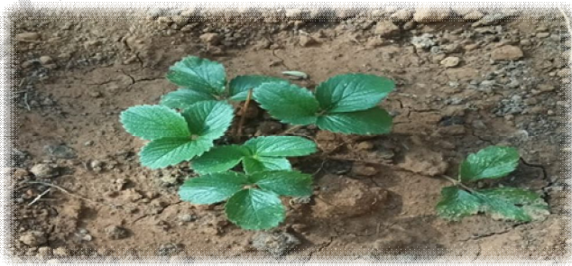
Fig2: Growing plants

reported that the use of farm yard manure, which is high in phosphorus, led to an increase in photosynthetic production, breaking bud dormancy and increasing flowering sites. The application of vermicomposts, which provide essential nutrients such as nitrogen, phosphorus, and potassium, as well as hormones, plays a crucial role in increasing gibberellic acid in roots, thereby breaking bud dormancy and increasing flowering buds and fruiting sites, as reported by Tagliavini et al. (2005) [16]. Additionally, Herencia et al. (2011) [17] found that the use of organic fertilizers led to an earlier onset of the reproductive stage in strawberry plants. Manures that contain favorable amounts of macro and micronutrients have been found to improve fruit setting and increase fruit size and weight by promoting the formation of carbohydrates more effectively than the use of inorganic triple phosphate fertilizer (Odongo et al. 2008) [15]. During the ripening process, fruits require large amounts of potassium and nitrogen, and composts are a rich source of these essential nutrients. A reduction in the number of fruits and flowers can be attributed to a deficiency of nitrogen and phosphorus during the flowering stage, resulting in smaller flowers and the abortion of female flower parts, as reported by Tagliavini et al. (2005), [16]