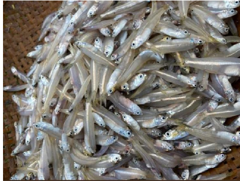
Figure 3. Anchovy

The raw material for anchovies to be processed into salted anchovies is obtained directly from the catch of local fishermen. If the anchovy raw material comes from fishermen, the anchovy head must be separated and discarded because there is sand that enters the gills from the network or fishermen's catch. While anchovies that come from collecting traders, the head does not need to be discarded because the anchovy is salted. the condition of the anchovies is clean.