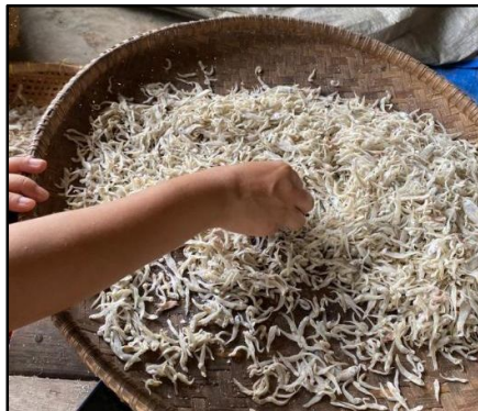
Figure 5. Sorting of Salted Anchovies

After drying the anchovies, they are sorted first before being sold. Sorting is done to sort anchovies with other fish and divide salted anchovies into two sizes, namely small size and large size for marketing. Kartika et al. (2022) revealed that sorting is separating anchovies with other fish that are mixed and continued packaging.