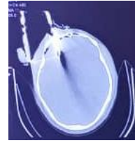
C. Axial CT of the skull demonstrating a foreign body