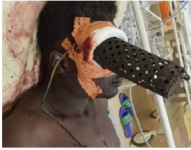
A. Aspect on admission