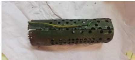
D. Removed foreign body (Fuel lock cylinder)