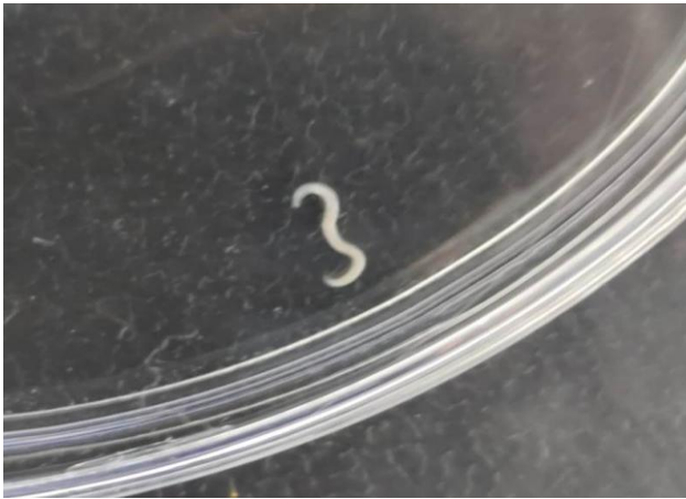
Figure 2. Adult Worm detected in duodenal aspirate