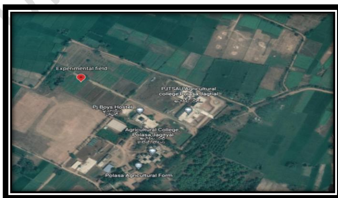
Plate 1. Satellite view of experimental site

The experiment was carried out at the College Farm, Agricultural College, Polasa, Jagtial, Professor Jayashankar Telangana State Agricultural University. The experimental site was located between 18° 50' 58" N latitude and 78° 56' 97" E longitude at an altitude of 243.4 meters above mean sea level (MSL) (Plate1.). It is assigned to the Northern Telangana Zone of Telangana. The soil was sandy clay loam, low in nitrogen (179.2), phosphorous (13.8) and high in potassium (310) with pH (7.53).