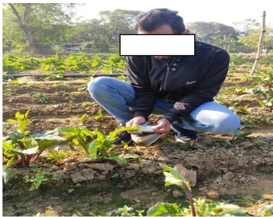
Figure 1 Beetroot influenced by different level of organic compost