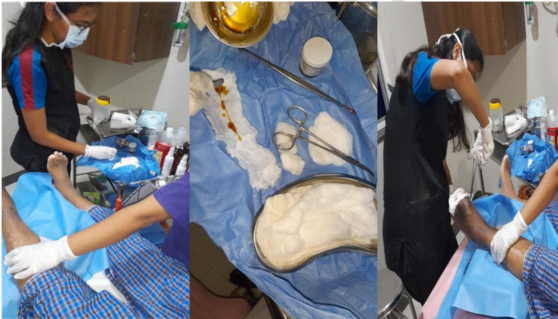
Fig 2. Showing application of honey on wounds.

Today being a lead in charge and a wound care apitherapist, I continue using different types of honey on different wound (Fig 2) and run a short observational training for nurses and other interested candidates on usage of honey on different wounds. I have also been involved in research and publication on honey [20, 22,23,25].