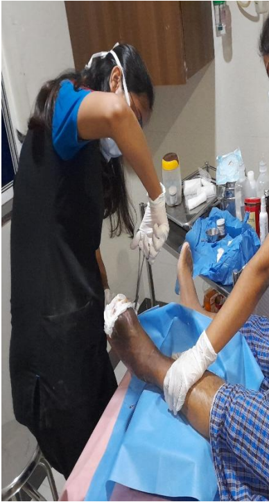
Fig 2. Showing application of honey on wounds.