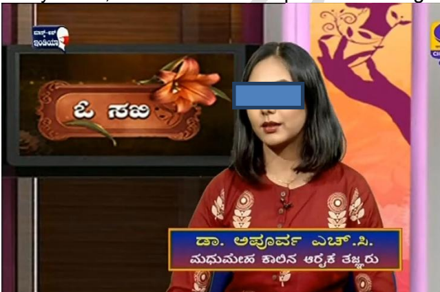
Fig 5. Showing education on diabetic foot provided through television media to public in general.

Many times, the education was provided through different media's that included radios and television (Fig 5).