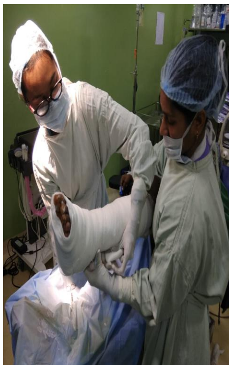
Fig 3. Showing training and learning of offloading (TCC) under supervision