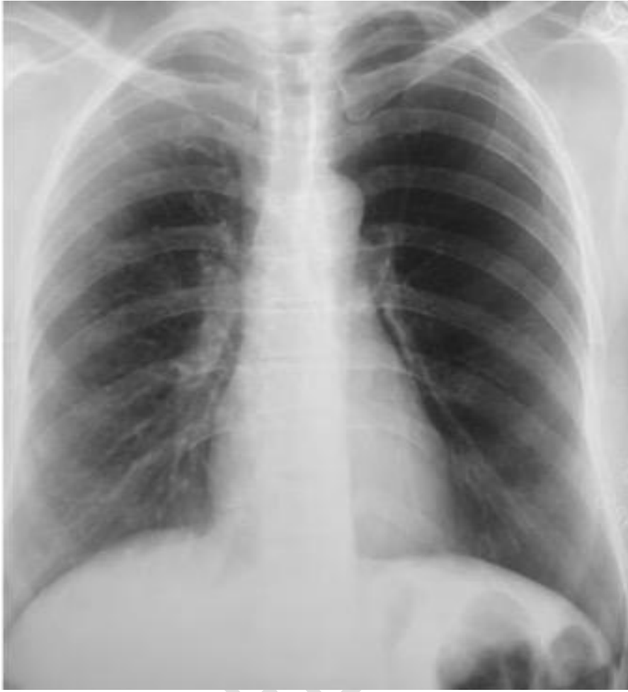
Figure 2 : Chest-CT