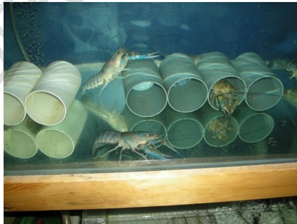
Fig. 4. Placement of Parallon as shelter in cultivation container

One critical factor influencing the survival of lobsters in aquaculture containers is the availability of shelters. Lobsters naturally inhabit the bottom of the waters and seek shelter, especially during moulting . The moulting phase is a vulnerable period for lobsters since their bodies are not protected by shells, making them easy prey for cannibalism [7]. Therefore, it is recommended to provide suitable materials as shelters in lobster cultivation ponds, such as PVC pipes, coral, bricks or mesh, roster, raffia rope, etc. This creates a habitat in the cultivation containers that resembles their natural environment.