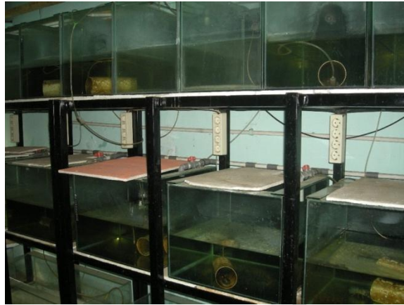
Fig. 3. Multilevel system aquarium

oxygen. To maximize land utilization, the aquariums can be arranged in a tiered system. Aquariums are primarily utilized for hatching eggs and rearing larvae.