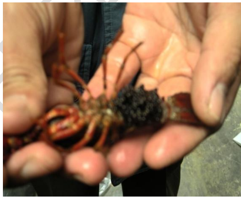
Fig. 7. Fertilized freshwater crayfish eggs

The spawning process typically occurs at night or early in the morning when the environment is calm and undisturbed, aligning with the lobsters' nocturnal behaviour. It starts with the release of oil-like fluid, followed by the female approaching the male parent aggressively. During this time, a copulation process resembling the letter "Y" takes place, involving the transfer of sperm. Once copulation is complete, the male parent disengages, while the female parent remains supine, releasing the eggs into the brood chamber.