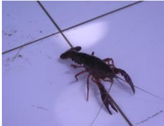
Fig. 1. Freshwater lobster

The location for lobster cultivation can be established on a small to medium scale, even in limited land areas. However, it is essential that the chosen location is supported by adequate facilities, infrastructure, and water quality. Having easy access to feed sources, medications, necessary equipment, and marketing locations is beneficial as it reduces transportation costs.