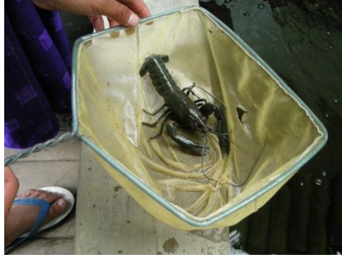
Fig. 5. Selected lobster parent (brood stock)

To select and prepare prospective broodstock for spawning, consider the following: