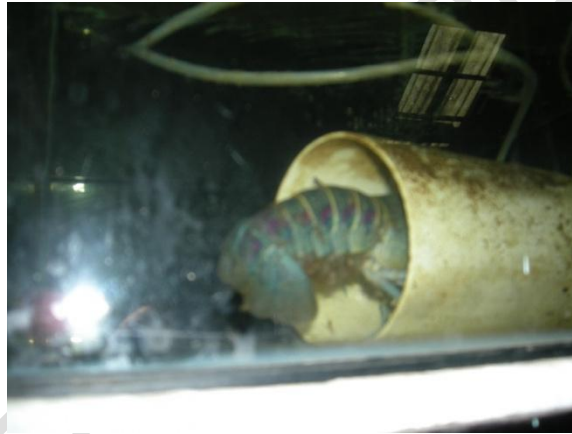
Fig. 8. Parent crayfish hatching the eggs

Before hatching, lobster eggs undergo an incubation process facilitated by the female parent. Approximately 70-80% of incubated lobster eggs hatch successfully. In some cases, lobsters that have spawned multiple times can achieve a full hatching success rate. Egg development phase, 0 – 7 days of color Yellow, 8-14 days Greenish yellow, 15-21 days dark brown, 22-28 days orange, 29-32 days Orange black spots, 33-39 days Hatch. and 40-47 days to become larvae.