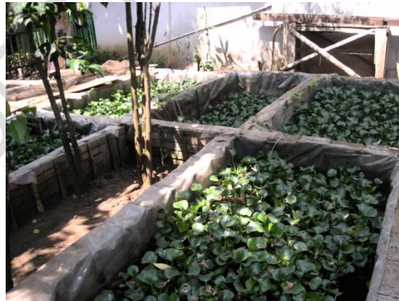
Fig. 2. Freshwater lobster cultivation pond unit

Lobsters can be successfully cultivated in cement ponds or aquariums. The selection of the cultivation container depends on the available land area and capital. Crayfish ponds are typically rectangular in shape, measuring approximately 2 x 3 x 0.5 meters. The pond walls are constructed to be slippery to prevent lobsters from escaping. Additionally, the bottom of the pond is sloped towards one corner with a 4-inch diameter drain pipe installed. Ponds are used for maintaining parent lobsters and for their growth.