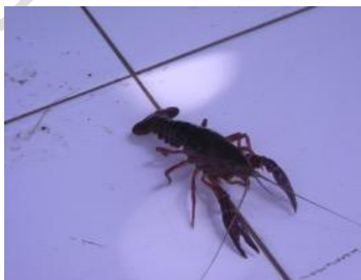
Fig. 1. Freshwater lobster

The selection of cultivation sites is crucial and should be based on the suitability with the original habitat of the cultivated organisms [3]. Cherax, a freshwater crayfish species originating from the tropical region of Northern Australia (Queensland), readily adapts to tropical climates in Indonesia.