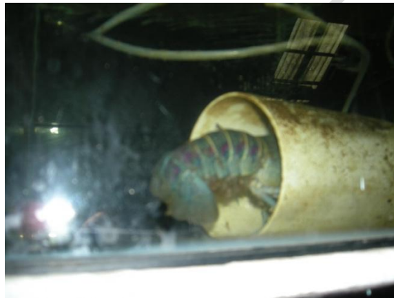
Fig. 8. Parent crayfish hatching the eggs

Before hatching, lobster eggs undergo an incubation process facilitated by the female parent. Approximately 70-80% of incubated lobster eggs hatch successfully. In some cases, lobsters that have spawned multiple times can achieve a full hatching success rate.