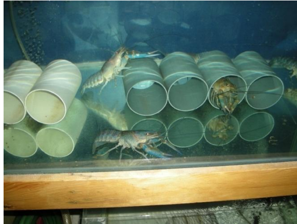
Fig. 4. Placement of Parallon (add PVC pipes of size) as shelter in cultivation container

One critical factor influencing the survival of lobsters in aquaculture containers is the availability of shelters. Lobsters naturally inhabit the bottom of the waters and seek shelter, especially during molting. The molting phase is a vulnerable period for lobsters since their bodies are not protected by shells, making them easy prey for cannibalism [4]. Therefore, it is recommended to provide suitable materials as shelters in lobster cultivation ponds, such as PVC pipes, coral, bricks or mesh, roster, raffia rope, etc. This creates a habitat in the cultivation containers that resembles their natural environment.