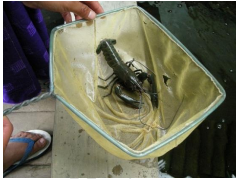
Fig. 5. Selected lobster parent (brood stock)

To select and prepare prospective broodstock for spawning, consider the following: