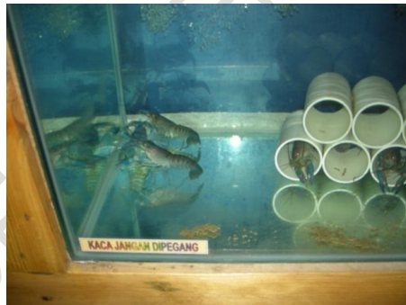
Fig. 10. Freshwater Lobster Display at an Ornamental Fish Shop

The distribution of ornamental freshwater crayfish from Bandung Regency has predominantly focused on Bandung City, utilizing a sales system that caters to both collectors and end-users, who are primarily ornamental fish enthusiasts and hobbyists. The consumers of freshwater crayfish in Bandung can find them in various locations, including Jalan Karapitan, Buahbatu, and the Pagarsih Ornamental Fish Market.