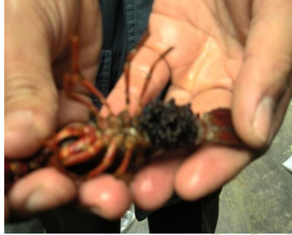
Fig. 7. Fertilized freshwater crayfisheggs

The spawning process typically occurs at night or early in the morning when the environment is calm and undisturbed, aligning with the lobsters' nocturnal behaviorbehaviour . It starts with the release of oil-like fluid, followed by the female approaching the male parent aggressively. During this time, a copulation process resembling the letter "Y" takes place, involving the transfer of sperm. Once copulation is complete, the male parent disengages, while the female parent remains supine, releasing the eggs into the brood chamber.