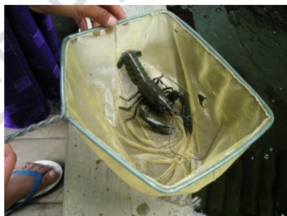
Fig. 5. Selected lobster parent (brood stock)

To select and prepare prospective broodstock for spawning, consider the following: