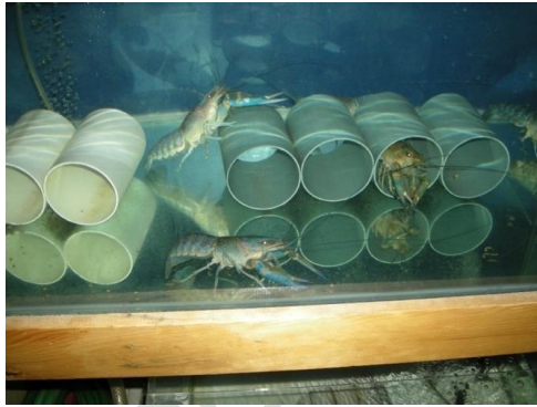
Fig. 4. Placement of Parallon as shelter in cultivation container

One critical factor influencing the survival of lobsters in aquaculture containers is the availability of shelters. Lobsters naturally inhabit the bottom of the waters and seek shelter, especially during molting. The molting phase is a vulnerable period for lobsters since their bodies are not protected by shells, making them easy prey for cannibalism [4]. Therefore, it is recommended to provide suitable materials as shelters in lobster cultivation ponds, such as PVC pipes, coral, bricks or mesh, roster, raffia rope, etc. This creates a habitat in the cultivation containers that resembles their natural environment.