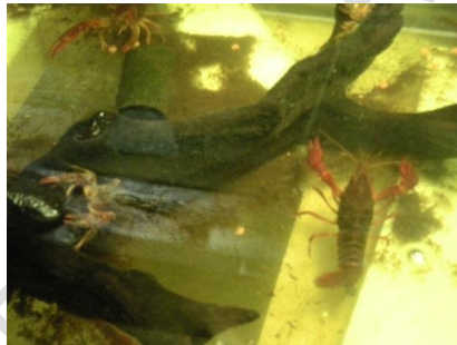
Fig. 6. Lobster parents to be spawned

Prospective broodstock can be fed small cubes of sweet potato and provided with earthworms as a protein source. Feed should be given twice a day, considering the nocturnal nature of lobsters, preferably in the late afternoon or late at night. In addition to natural food, artificial pellets can also be provided [7]. Feeding chopped meat should be avoided to prevent cannibalism among lobsters.