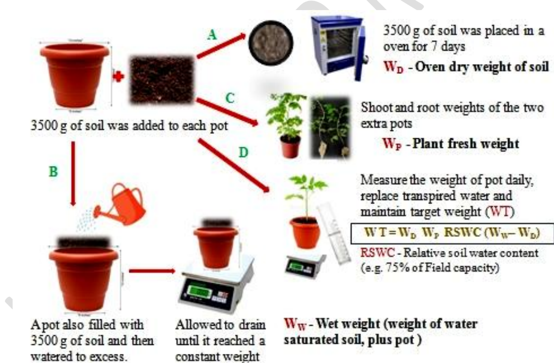
Figure 1. Gravimetric method for creating drought stress

yield per plant was taken and used to compare the differences between the yield from colonized by P. indica and non-colonized seedling under different drought conditions and control.