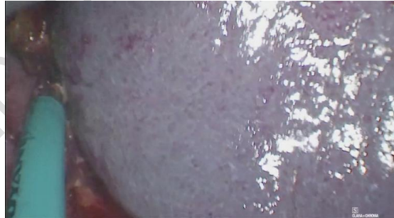
Fig. 1. Laparoscopic Splenectomy.

Laparoscopic splenectomy technique: (6,17,22,24)