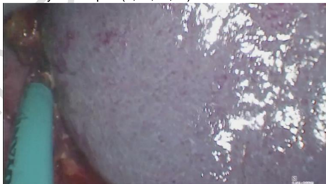
Fig. 1. Laparoscopic Splenectomy.

Laparoscopic splenectomy technique: (6,17,22,24)