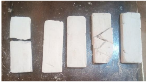
Fig 2. Some sample of the test tiles