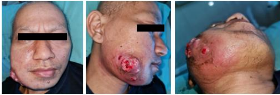
Fig. 1. Clinical Picture of the Patient in March 2021