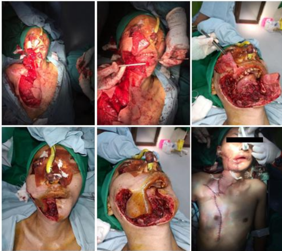
Fig. 5. Picture during Operation

normal: 33-45%), high leukocytes (17.700/ul, normal: 4.5-11.000/ul), normal platelet (289.000/ul, normal: 150.000-450.000/ul), low erythrocyte (4.18 million/ul, normal: 4.5- 5.9 million/ul).