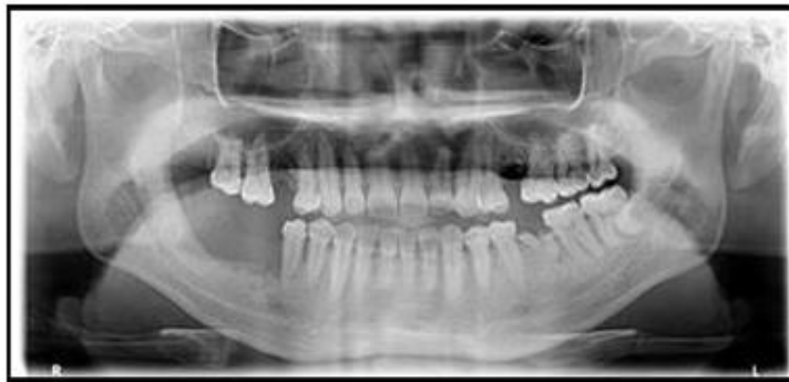
Fig. 3. Panoramic X-Ray Picture