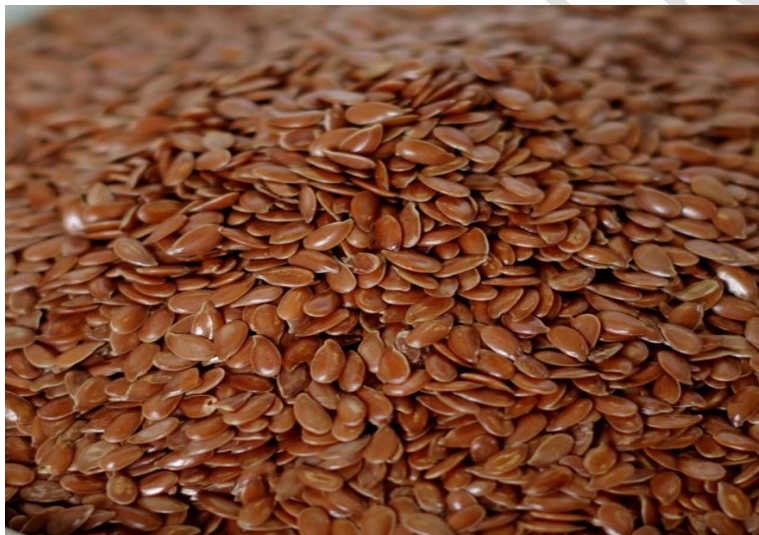
Plate 1: image of Flaxseed

Flaxseed is abundant in fat, protein, and dietary fiber [16]. The main components of flaxseed include mucilage (6%), insoluble fibers (18%), proteins (25%), and oils (30-40%), with \alpha -linolenic acid comprising the majority of the fatty acids (50-60% of oils). Flaxseed also contains lignans [17]. Studies conducted on animals and human subjects consuming flaxseed meal have demonstrated a reduction in blood cholesterol levels [13,18]