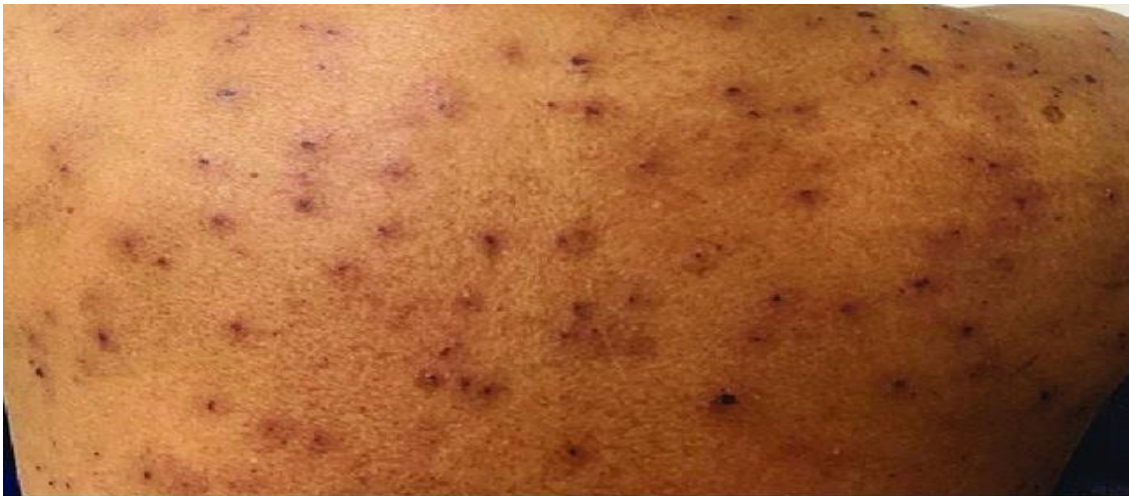
Figure 2: Multiple erythematous papules on the back.

Figure1: MRI Brain showing multiple T2, FLAIR hyperintensities with diffusion restriction in bilateral fronto parieto-occipital lobes and basal ganglia suggestive of acute infarcts.