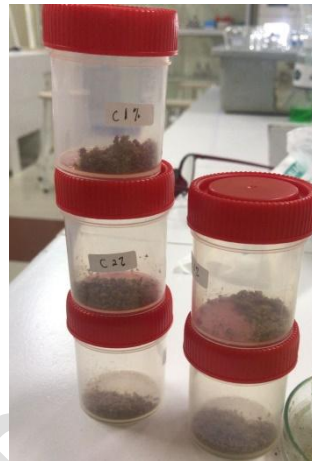
Figure 1. Activated charcoal from the citronella plant ( Cymbopogon nardus )

Activated charcoal in this study is a porous solid containing 85-95% carbon produced from heating at high temperatures. This charcoal is obtained from lemongrass plants which are processed through the activation stage with NaOH. Activated charcoal is shown in Figure 1.