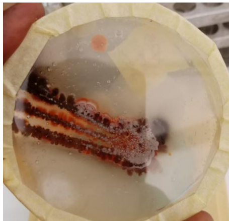
Figure 2: Colony morphology of S. clavuligerus showing red pigmented rhizoid margin colonies.