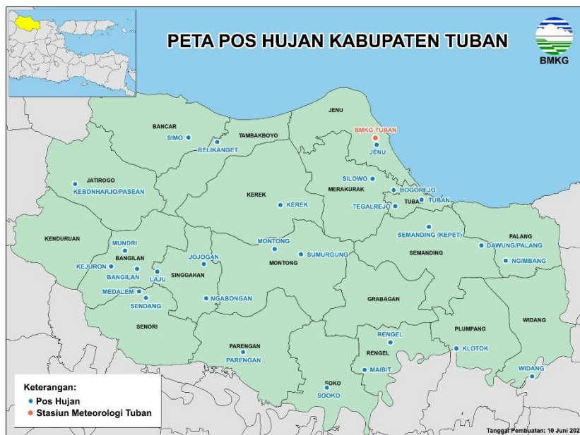
Figure 1 Rainfall Station Map of Tuban Regency.

This research was conducted at the BMKG Class III Meteorological Station in Tuban, East Java. The map of the research area is shown in the following image.