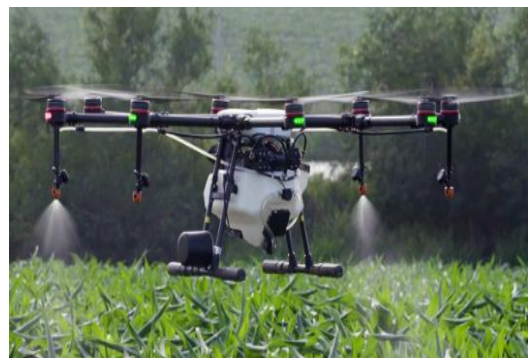
Figure 3. Spraying nutrients through drones