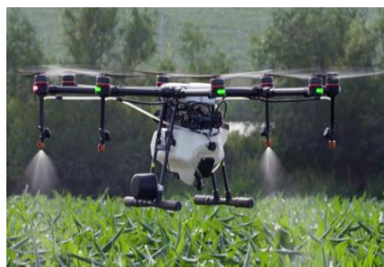
Figure 3. Spraying nutrients through drones