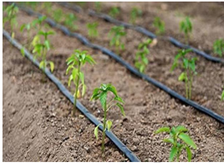
Figure 2. Drip irrigation