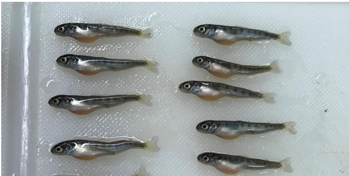
Figure 2. Showing lethargy, swollen belly, and increased early life-stage mortality due to Thiamine Deficiency in Chinook Salmon. Photo Plate retrieved from (Heather, 2022)